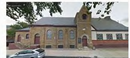
TACONY BAPTIST CHURCH 4715 DISSTON STREET